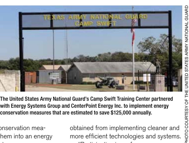
The United States Army National Guard's Camp Swift Training Center partnered with Energy Systems Group and CenterPoint Energy Inc. to implement energy

The work to be performed is typically outlined in a Utility Energy Services Contract (UESC), an agreement between the local utility provider and the governmental agency that allows the utility to assist the agency in