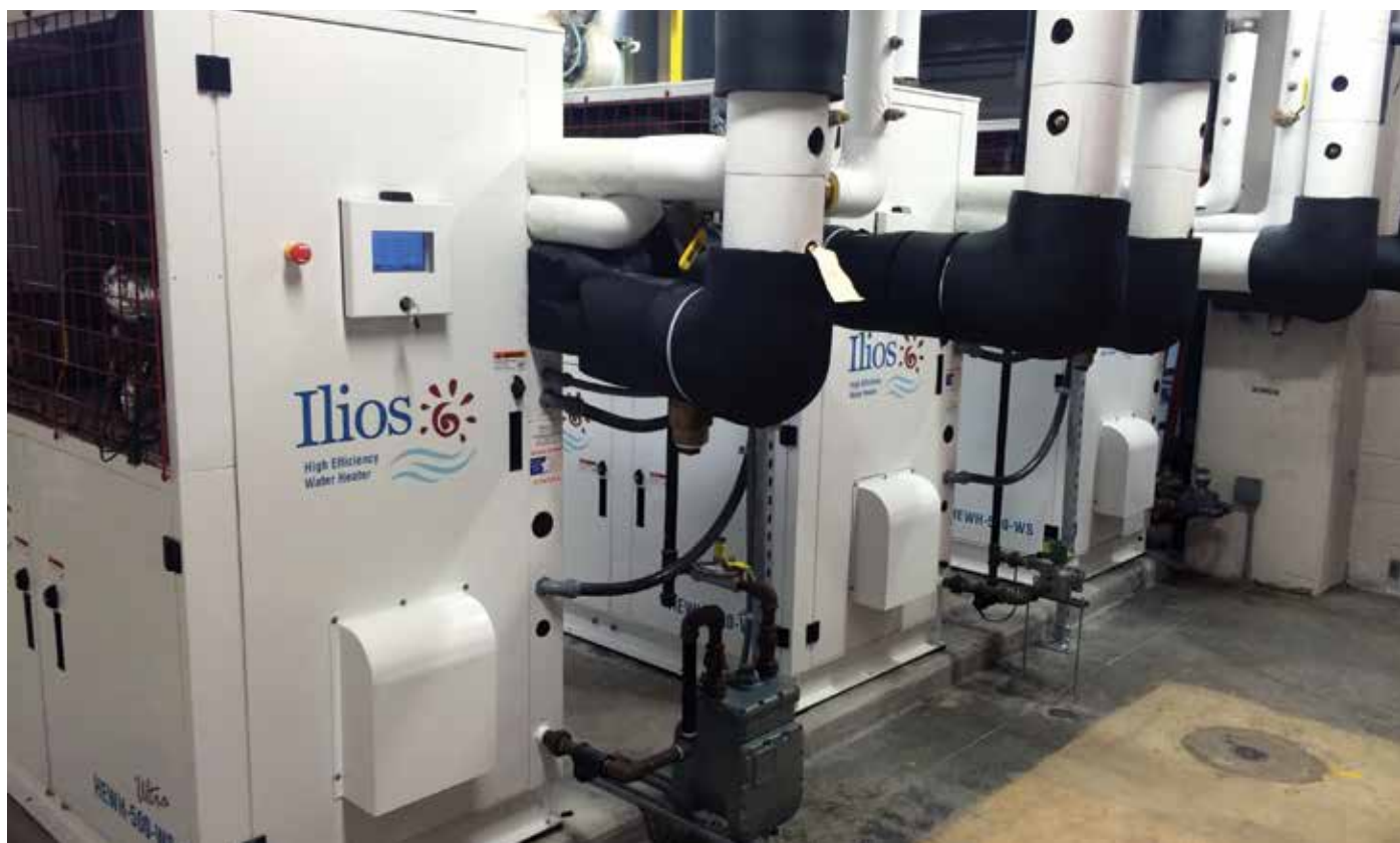
The llios system uses a natural gas engine rather than an electric motor to power the compressor while recovering waste heat from the engine. The engine's waste heat is recovered and used in combination with the heat extracted in the refrigeration cycle, increasing system efficiency by up to three times that of a conventional boiler and up to 50 percent more than an electric heat pump when compared on a source efficiency basis.

"It's a simpler way, and it's more efficient," Lafaille said. "You get the same technology for a tenth of the cost."