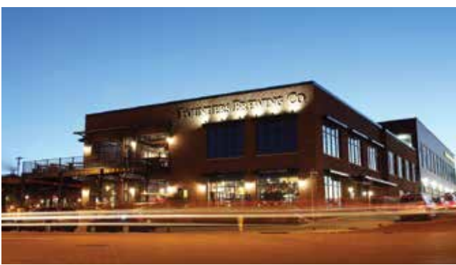
Founders Brewing Co., a Grand Rapids, Michigan, brewery and taproom, has 26 infrared natural gas heaters spread over two covered porches and a patio. The heaters — a combination of tube-style radiant heaters and mounted and free-standing umbrella style heaters — cover about 2,000 square feet.

Infrared heaters come in two versions: low-intensity tube heaters and high-intensity heaters.