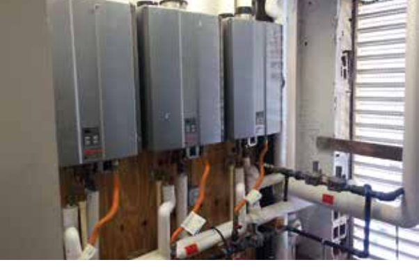
The Rinnai Tankless Rack System, featuring three natural gas tankless water heaters, was installed in the 16-story Thomas Jefferson Tower. The installation drastically reduced electrical system needs by 5,000 amps as well as decreased cost, space and maintenance requirements in the historic building.

"Our tenants love the fact that they have instant and endless hot water and the availability of gas stoves," Dzyuba said.