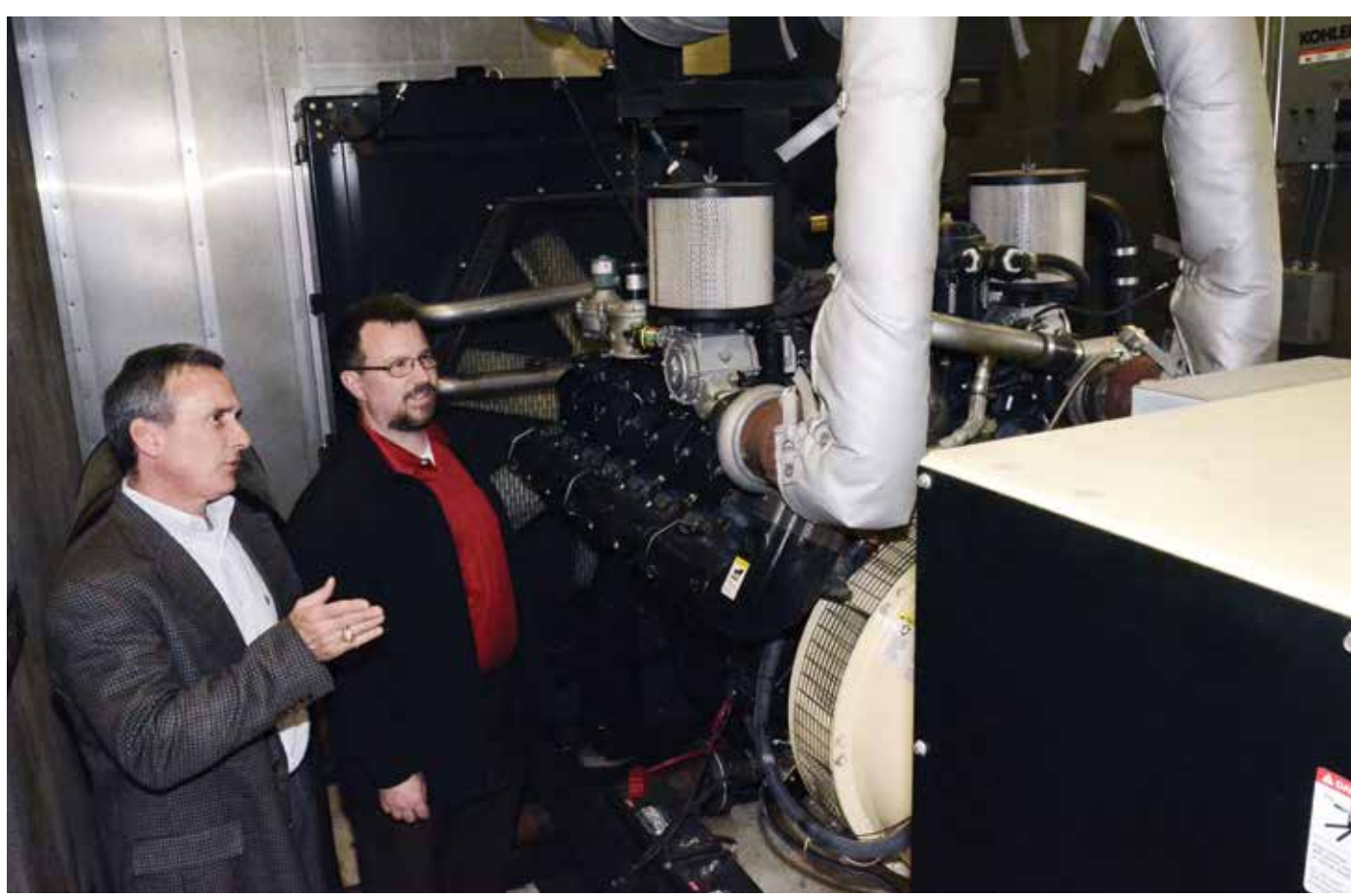
The CHP system has more than doubled the natural gas consumption at the Oak Point Recreation Center, which uses about 12,000 Mcf per year.