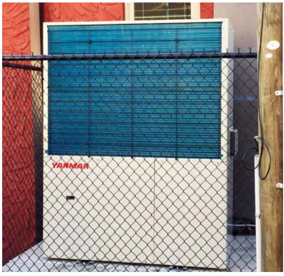
A Yanmar VRF heat pump, like above, produced cost savings of $1,432 a month for Adairsville City Hall in Georgia.

The city reports that in the first year of operation, the 16-ton VRF unit provided operating cost savings of $1,432, or 80 percent, per month. It can run 100 percent of its heating and cooling needs, can be controlled remotely, and used to turn off heating and cooling in unoccupied areas. This will reduce its carbon footprint by 30 percent, and slash electrical consumption for cooling by 90 per-