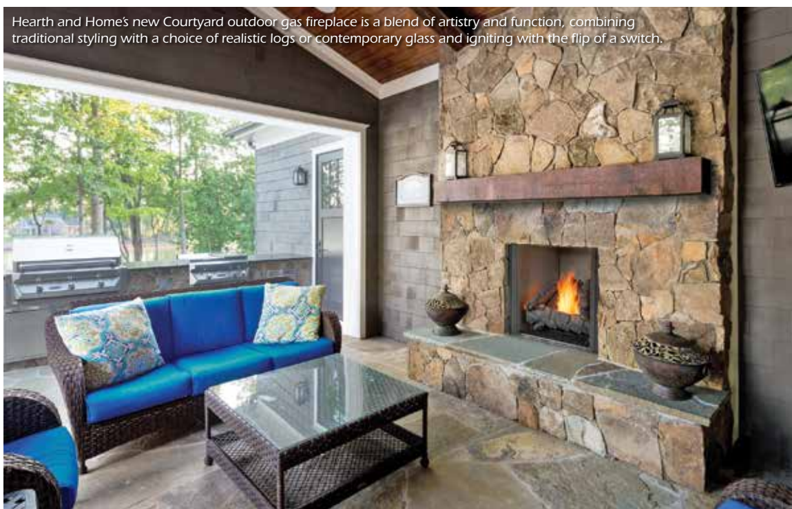
Hearth and Home's new Courtyard outdoor gas fireplace is a blend of artistry and function, combining traditional styling with a choice of realistic logs or contemporary glass and igniting with the flip of a switch.