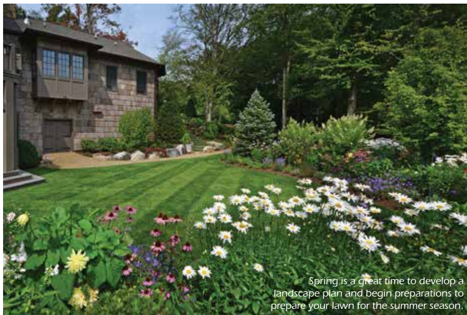
Spring is a great time to develop a landscape plan and begin preparations to prepare your lawn for the summer season.