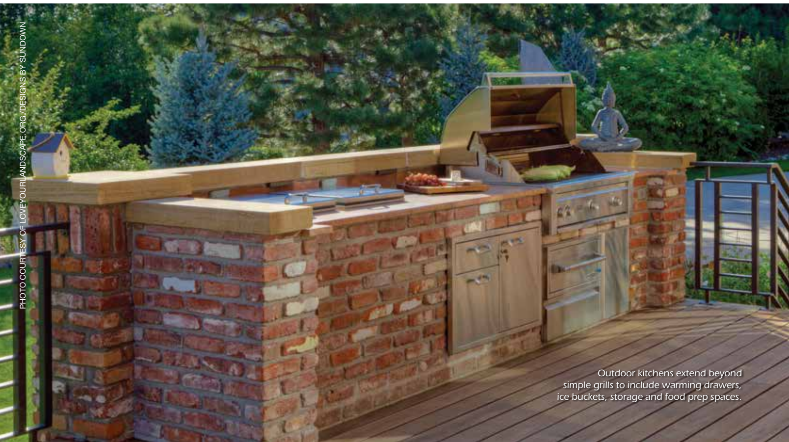
Outdoor kitchens extend beyond simple grills to include warming drawers, ice buckets, storage and food prep spaces.

PHOTO COURTESY OF LOVEYOURLANDSCAPE.ORG./DESIGNS BY SUNDOWN