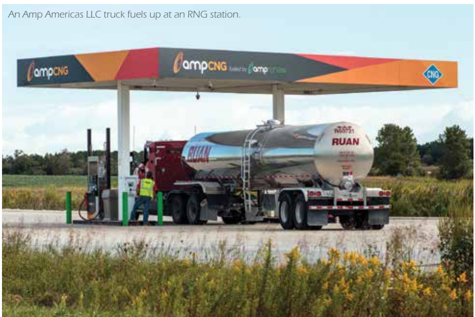
An Amp Americas LLC truck fuels up at an RNG station.

Additionally, a new state law mandates only renewable and zero-carbon resources be used for electricity generation by 2045. Another law known as Senate Bill (SB) 1440 requires the state's Public Utilities Commission and Air Resources Board to consider adopting RNG procurement targets for gas companies in the state. In other words, a portion of all the gas consumed by residential and commercial customers would have to be RNG.