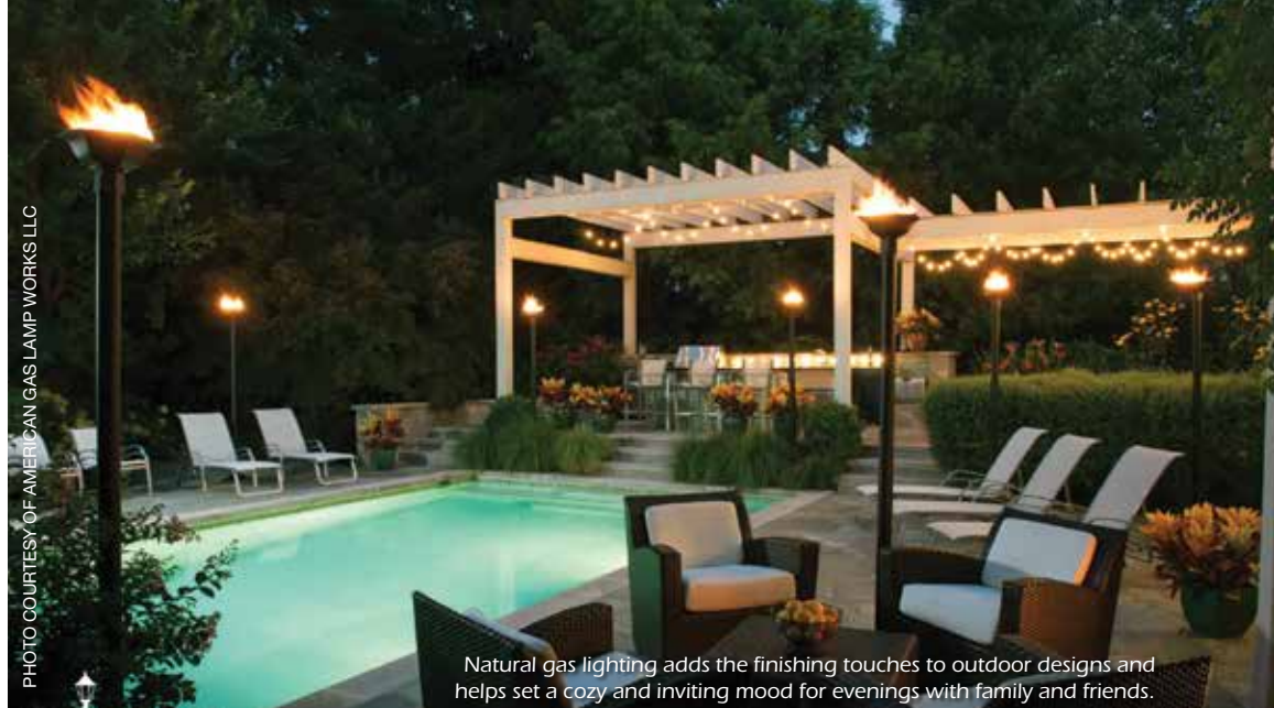
Natural gas lighting adds the finishing touches to outdoor designs and helps set a cozy and inviting mood for evenings with family and friends.