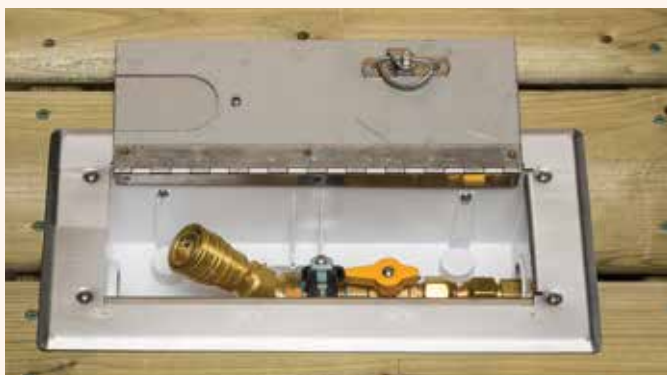
Burnaby Manufacturing Ltd.'s Wood Deck Versatile Gas Plug™ offers easy plug-in convenience for natural gas appliances while concealing unsightly pipes and valves.

Convenience outlets come with a variety of safety features. They automatically shut off if the temperature reaches 250 degrees and most require that the manual valve be shut off before the appliance is connected or disconnected. ■